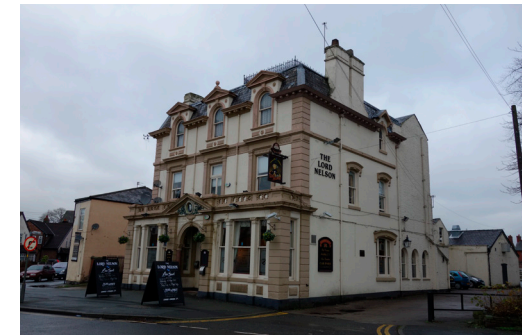
The Lord Nelson